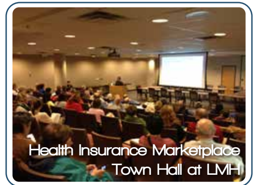
Health Insurance Marketplace Town Hall at LMH