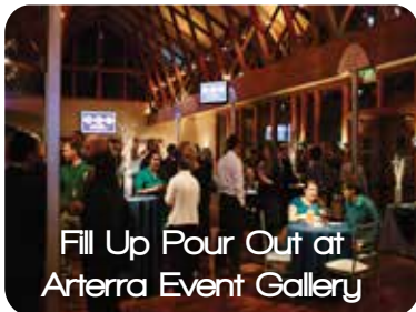
Fill Up Pour Out at Arterra Event Gallery