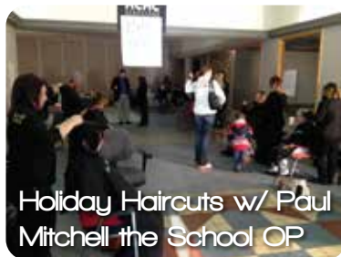
Holiday Haircuts w/ Paul Mitchell the School OP